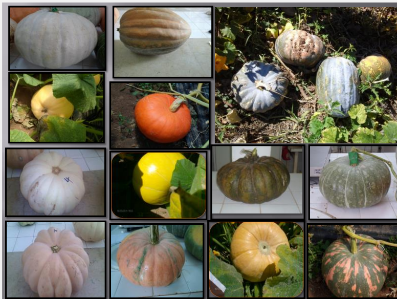
Fig. 1. Diversity of fruit size, shape, and colour of the Cucurbita maxima accessions collected from different zones of Tunisia