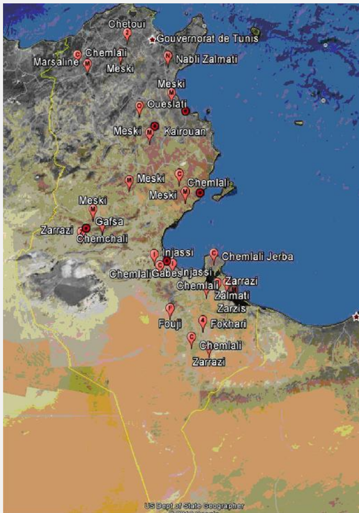
Figure 1. Geographic distribution of Tunisian variety accessions included in the study.